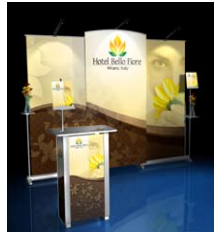
Occasions tables complement Skyline portable and structural exhibits.

Skyline Exhibits 3355 Discovery Road St. Paul, Minnesota 55121