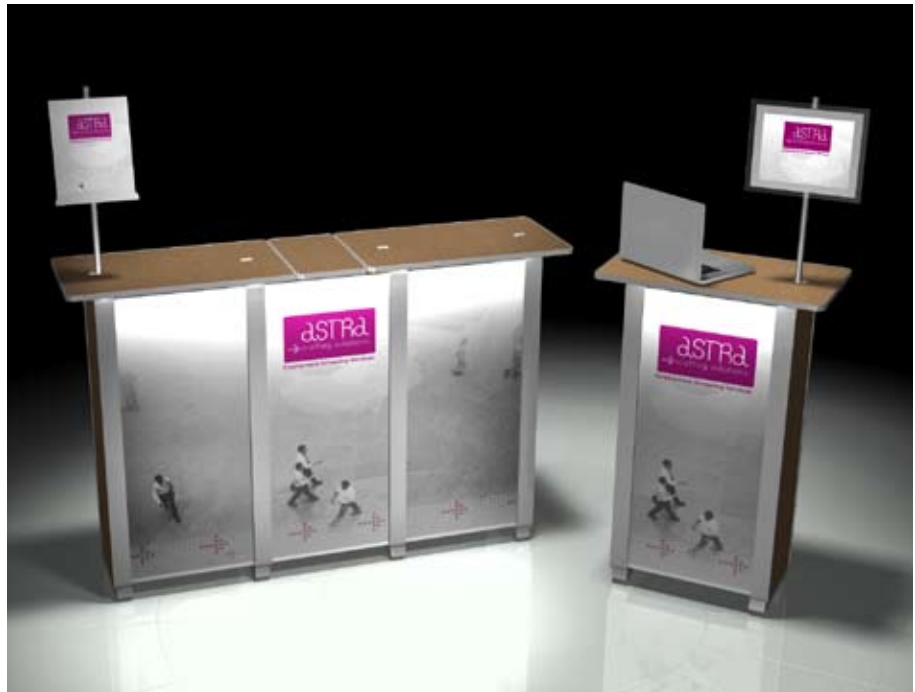
A single Occasions™ table is great for smaller spaces. Two side-by-side units with connecting center panel provide more workspace and storage for larger spaces.

Beyond trade shows, Occasions tables are perfect for corporate lobbies, retail environments, product sampling, even on campus.