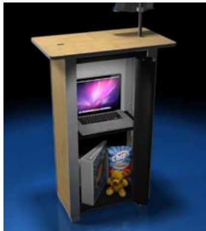
Two 9" x 14" inch shelves provide concealed storage with easy access.